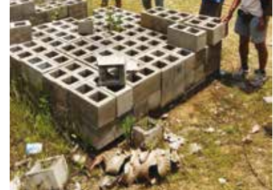
The organisation intends to slowly replace all their timber buildings to cement block ones, to reduce the amount of time spent on maintenance and repairs. Craig has a local team that makes their own cement blocks, even customising them to suit their construction method.