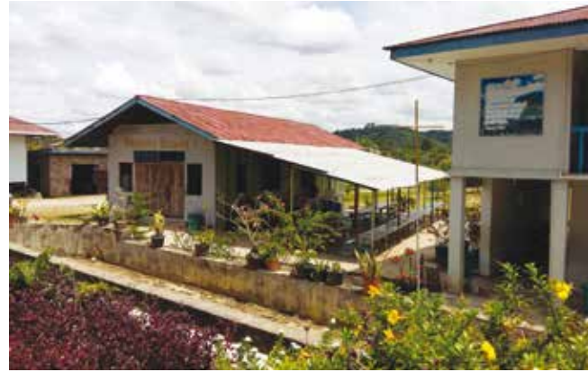
One of the foundation's success stories is their Manna Bakery, which produces bread and other baked goods for the school while selling up to 5000 loaves weekly in nearby towns.

After publishing the article last year, we followed up with our promise to visit Craig Pilcher, and measure an existing timber classroom block, and draw up its extension adjacent to it. The timber building measuring 7 metres wide by 75 metres long is slowly falling apart and Craig is keen to have the new block ready as soon as possible. The timber building will not be demolished completely, instead its internal walls will be dismantled, its structure reinforced and converted into a verandah space for school and social activities.