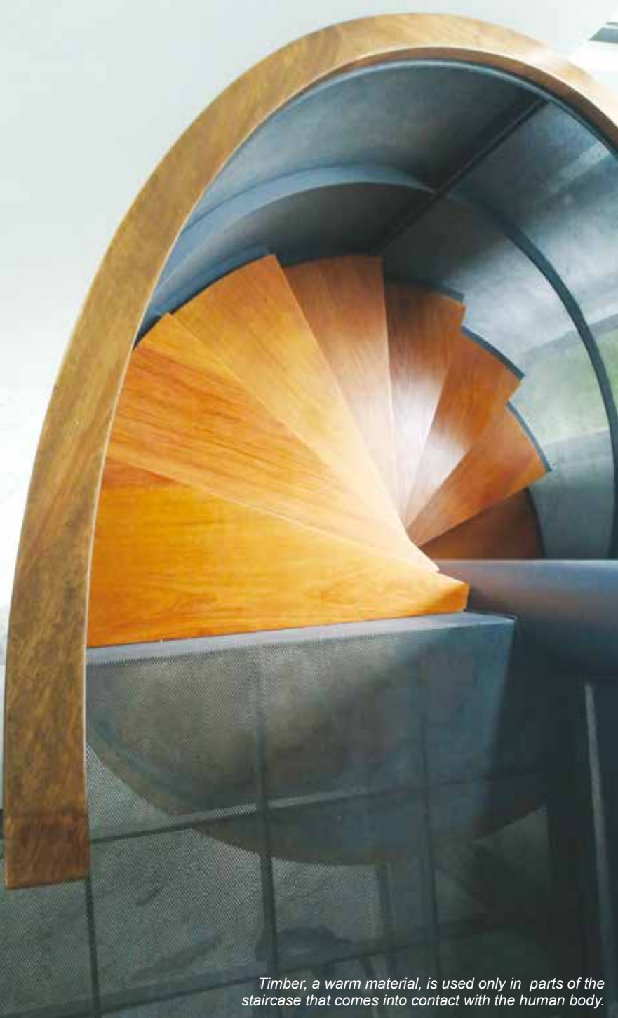
Timber, a warm material, is used only in parts of the staircase that comes into contact with the human body.