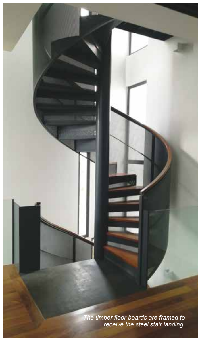
The timber floor-boards are framed to receive the steel stair landing.