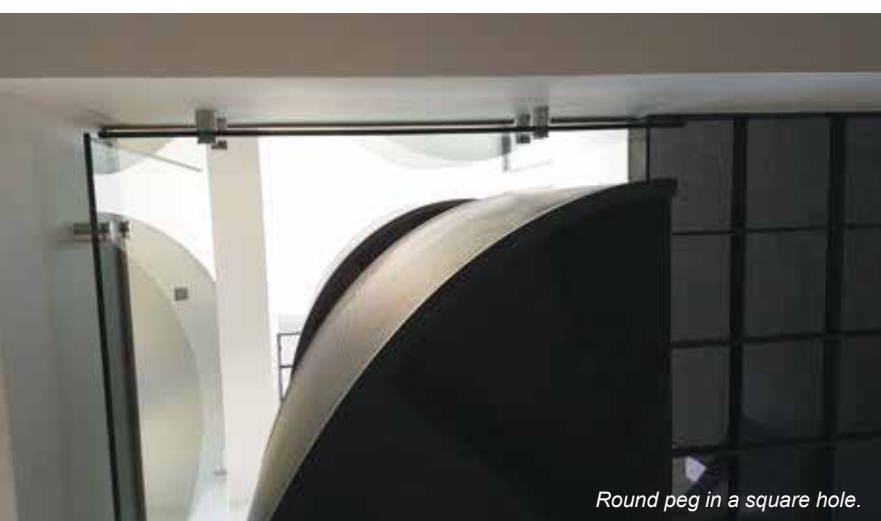
Round peg in a square hole.