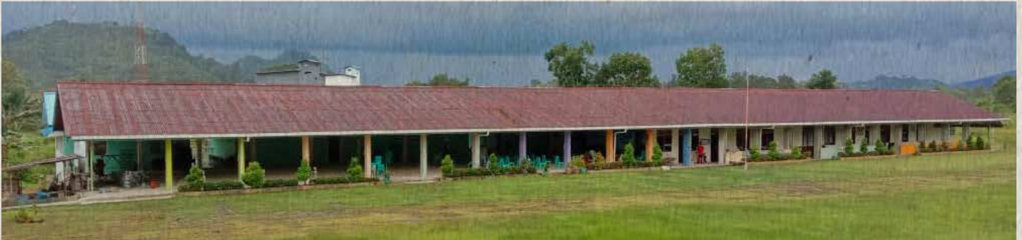
The new primary school building with the new classrooms behind it.