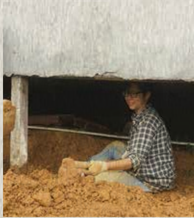
Digging the holes for new pad footings at the building's rear.