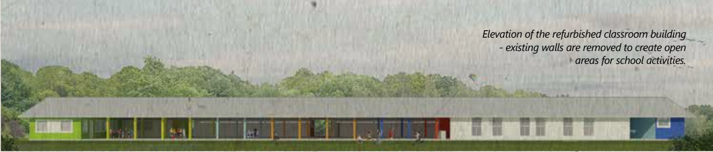
Elevation of the refurbished classroom building - existing walls are removed to create open areas for school activities.