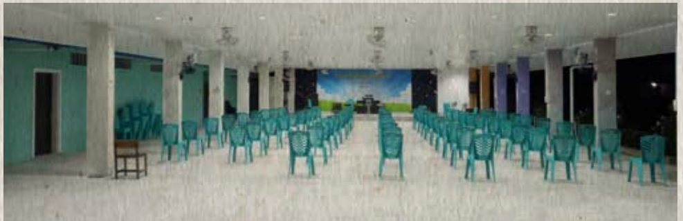
The old classroom walls have been removed to create a play area, an assembly hall and place for worship.