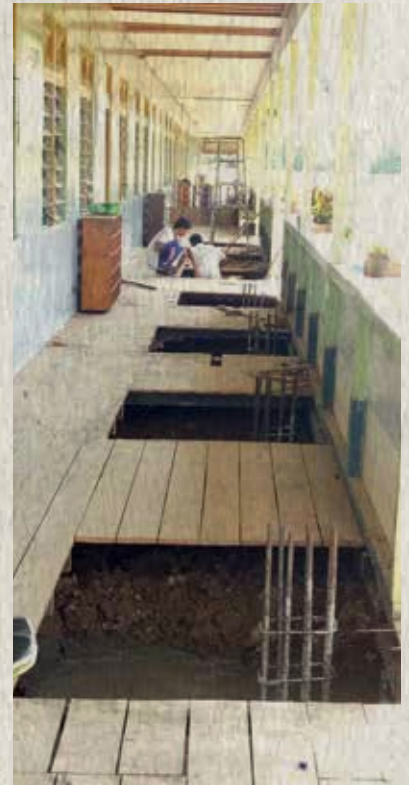
The flooring will become the permanent formwork for the new concrete floor.