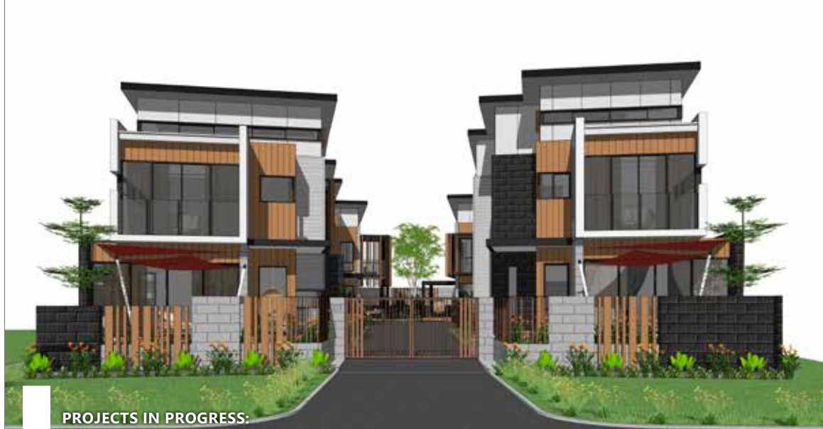
PROJECTS IN PROGRESS: ARDROSS VILLAS, PERTH, WA by Chalmers & Co Design - PG 2

News+FLASH is the digital offspring of INTERSECTION. It is published digitally each fortnight for the foreseeable future, until we run out of ideas, articles or money.