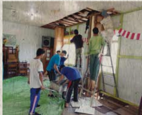
New RC columns were then built to support the existing roof structure.