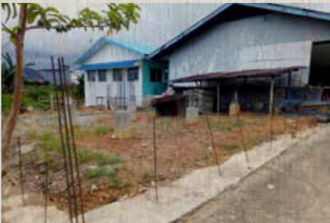
The new block can be seen behind the existing classrooms.