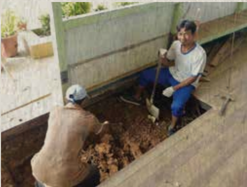
The existing timber flooring was opened up to cast footings.