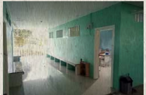
Breezeways are introduced in between the classrooms, to ventilate the activity areas.