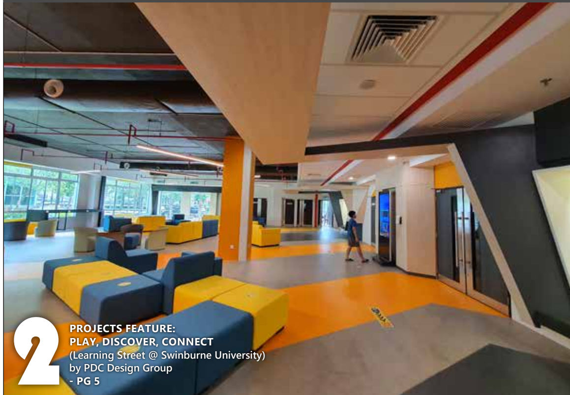
2 PROJECTS FEATURE: PLAY, DISCOVER, CONNECT (Learning Street @ Swinburne University) by PDC Design Group - PG 5