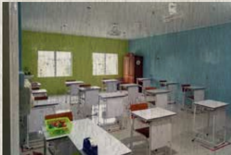
Lessons are currently conducted partially in class and online.