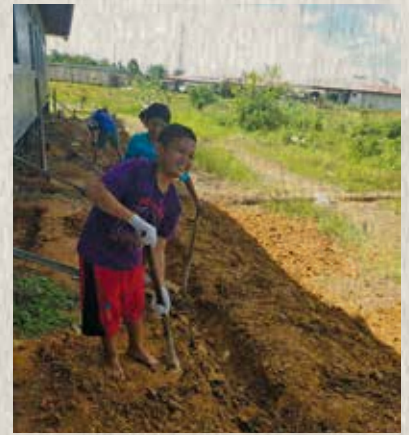
Getting the young ones involved.