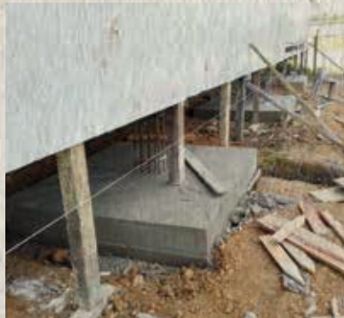
A few weeks later, footings were cast.