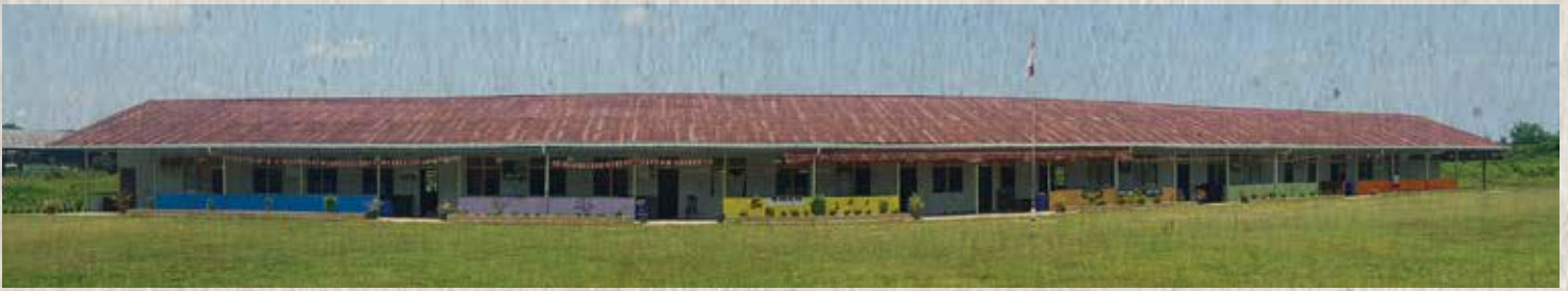
The old primary school building.