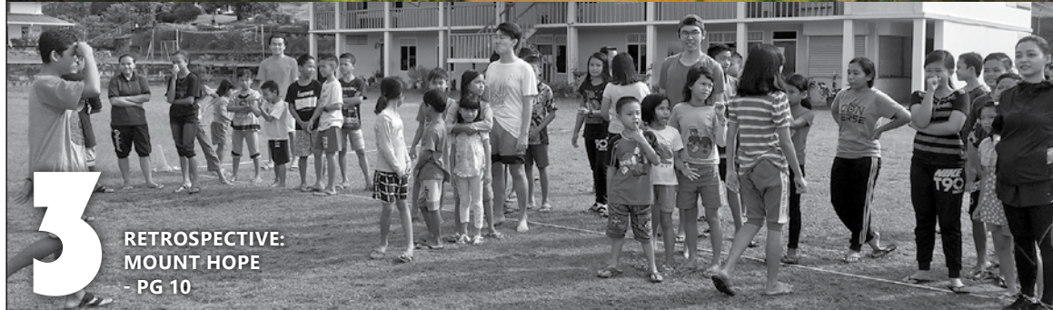
3 RETROSPECTIVE: MOUNT HOPE - PG 10