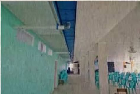
The junction between the old and the new.